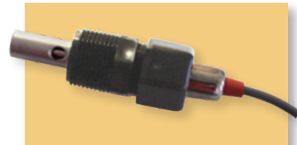
Assembled Conductivity Sensor

The CS51 is ideal for general purpose use up to 20,000 \mu S/ppm.